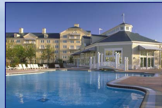
Hotel Break « A Golfing Holiday »